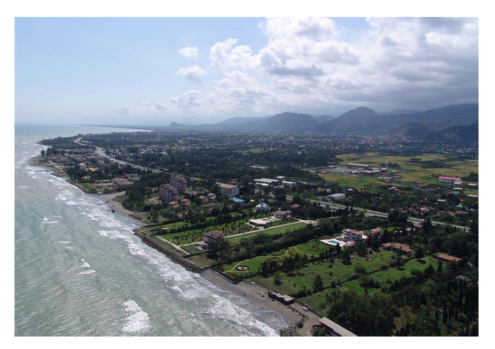
Figure 3. Ramsar, Iran. The most radioactive inhabited area on the Earth.

Iran (Ramsar). There are areas where the dose rate ranges from 0.7 to 50 \mu Sv/hr due to high uranium content in the water (Figure 3) ("Interesting facts about atom and radiation", 2009). Residents receive an average radiation dose of 10 mSv/yr, ten times more than the ICRP recommended limit for exposure to the public from artificial sources and four times more than worldwide average natural dose to humans; in some areas of Ramsar annual radiation absorbed dose from background radiation is up to 260 mSv/yr, higher than the 20 mSv/yr permitted for radiation workers (Mortazavi S.M.J. & Karamb P.A., 2005; Ghiassi-nejad M. et al., 2002).