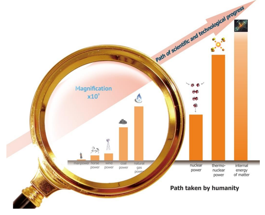
Figure 1. Path taken by humanity ("Environment and emergency management", 2014)

Tens of millions of people are constantly getting exposed by the natural radiation background, including the natural radioactive gas radon (toron), every year getting a dose at the level of 5-10 mSv (millisieverts). Whereas, there have been certain areas with an increased natural radiation background where a dose of radiation could reach annually up to 15-30 mSv, where children and women have also been exposed to this natural radiation for centuries, while the world average annual dose of exposure per person is about 2.4 mSv. This being said, the overall lifetime dose in the areas with the increased radiation background could reach 1000 mSv and more without any negative health outcome diagnosed during special epidemiological exams.